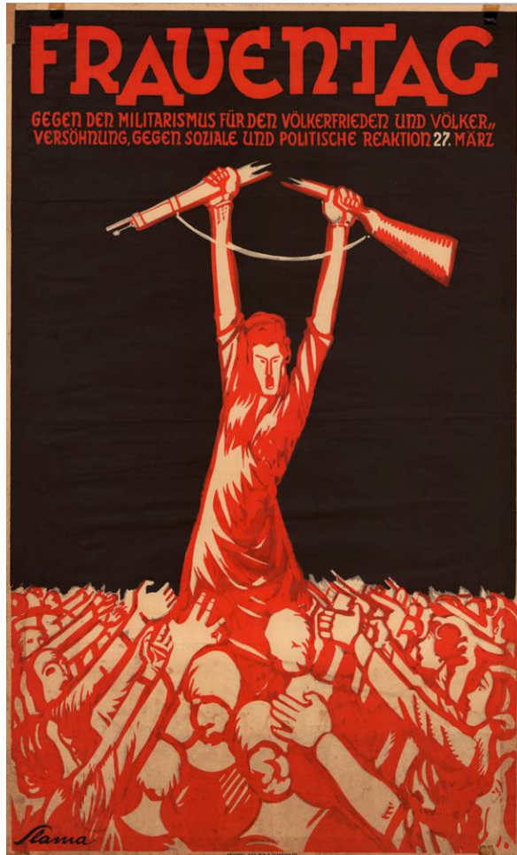
International Women's Day, 1930